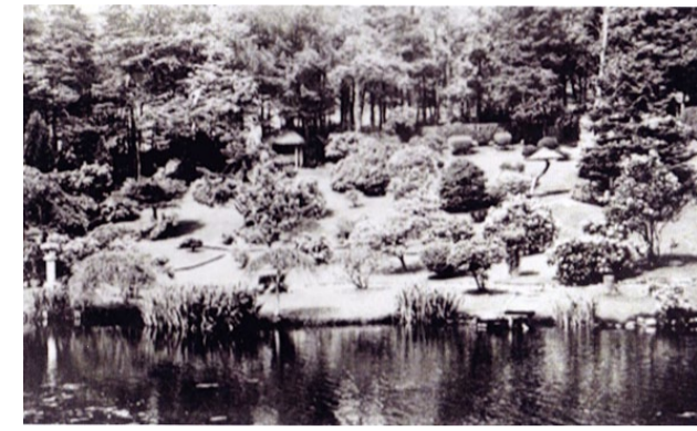
Fuji slope in 1931