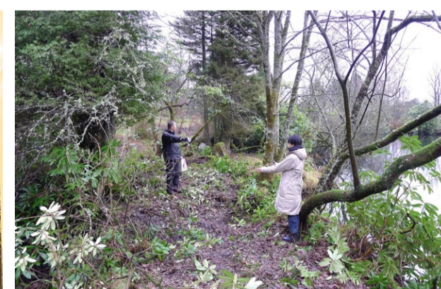
A photo taken at same location