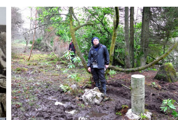
A photo taken at same location