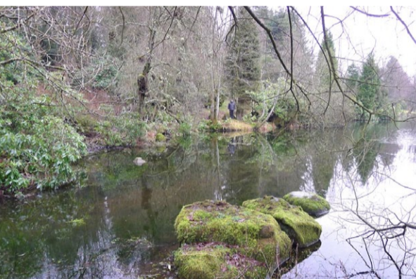
A photo taken at same location