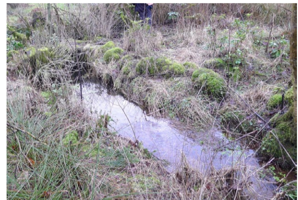
Current stream with stone works