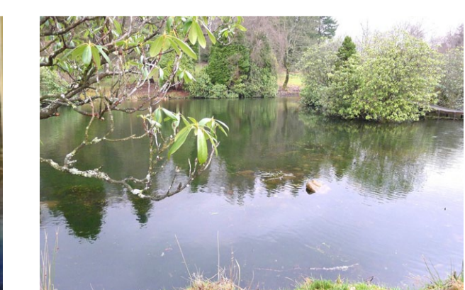
A photo taken at same location