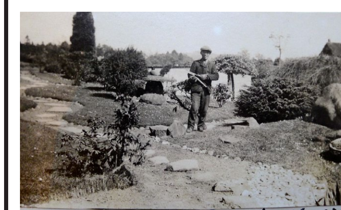
Mr Matsuo at the flat garden in 1926