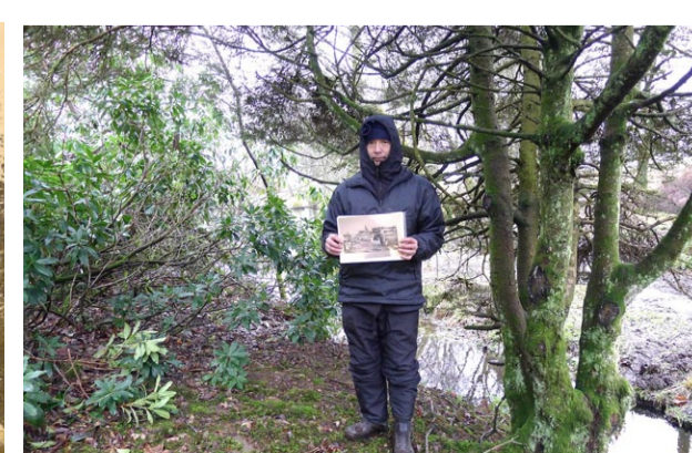
A photo taken at same location