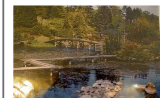
Zig zag bridge and central island in 1955