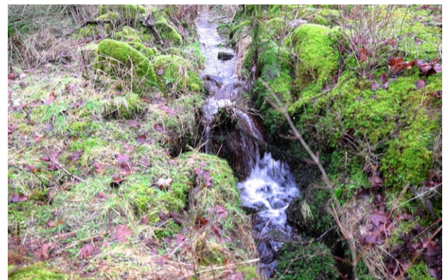
Current stream with small waterfall