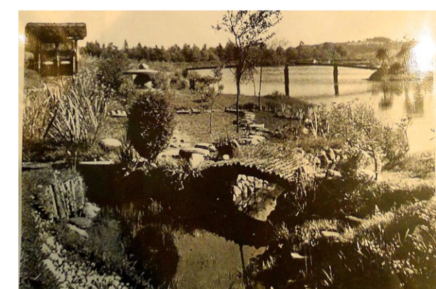
Wooden bridge on the islands