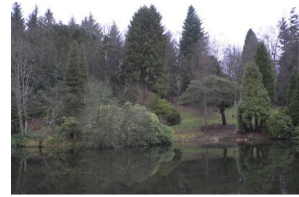
Current Fuji slope