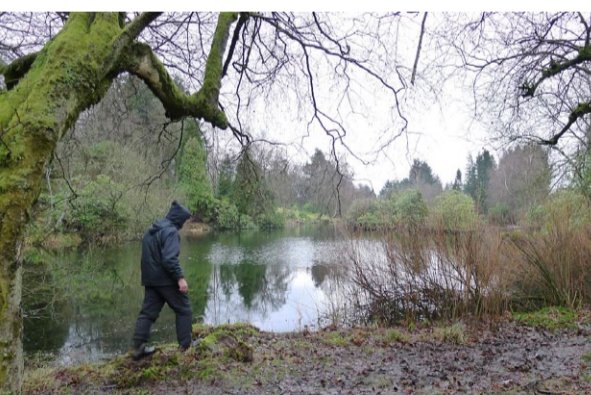
A photo taken at same location