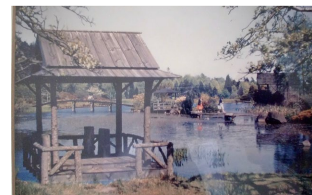
Azumaya (Rest house)